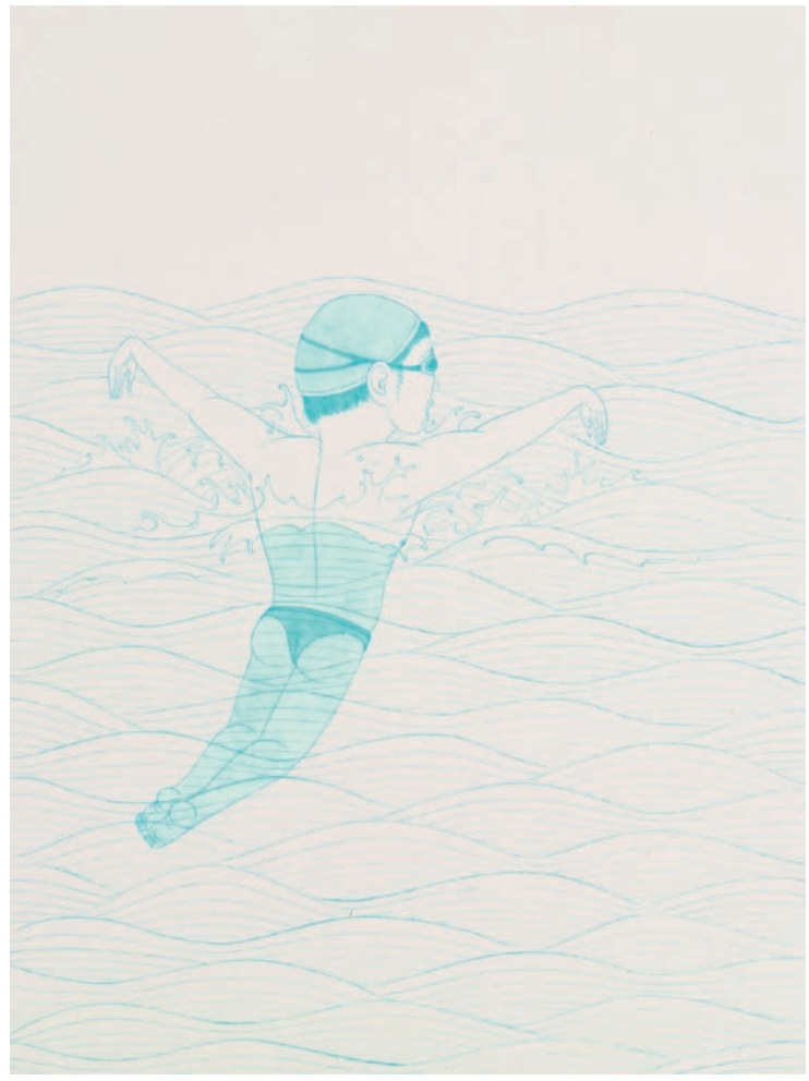
Wilson Shieh "Swimmer 4", 2007, Drawing, 84 x 86,5 cm