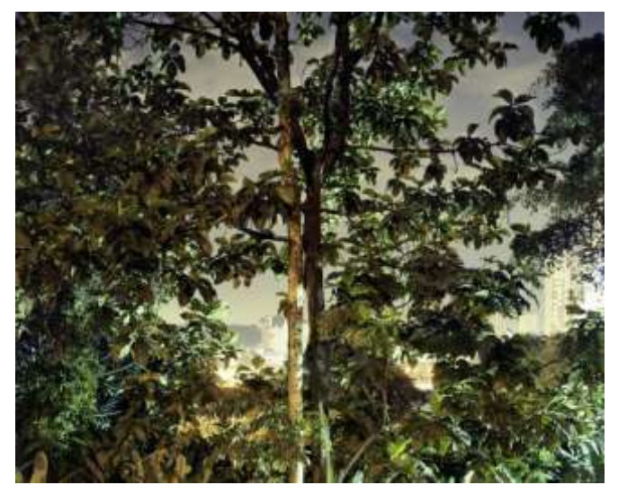
Alll photos from the series Paradise Now, © Peter Bialobrzeski

The rash urbanization of our day affects mostly Africa and Asia in particular: demographers at the UNO predict that, by 2010, most of the megacities will be in Asia. Already, Asia has three times as many cities as