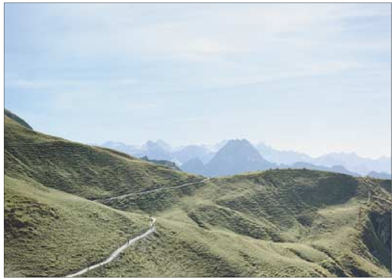
'Heimat, #19", 2003