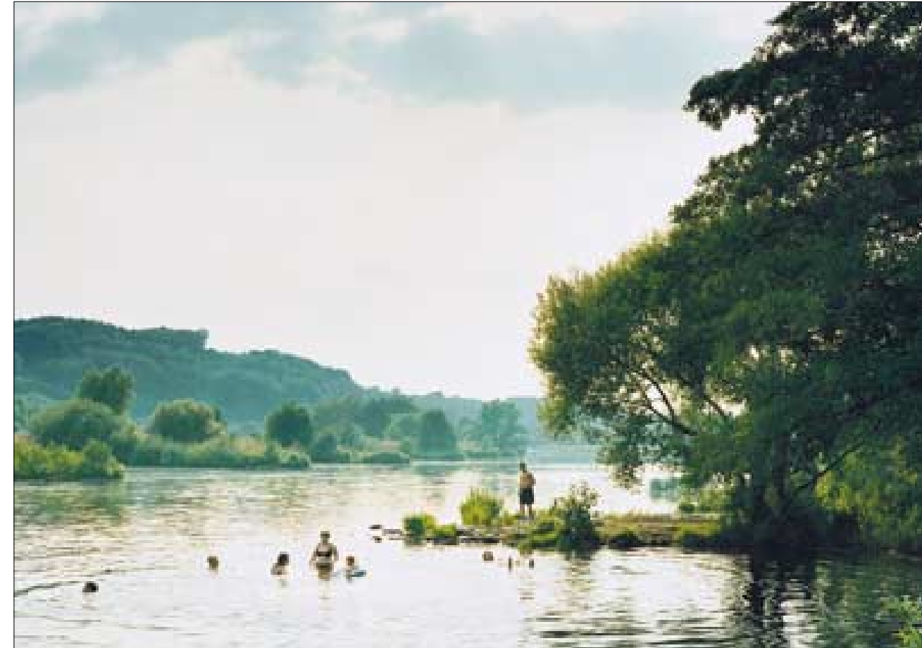
Heimat, # 25", 2004