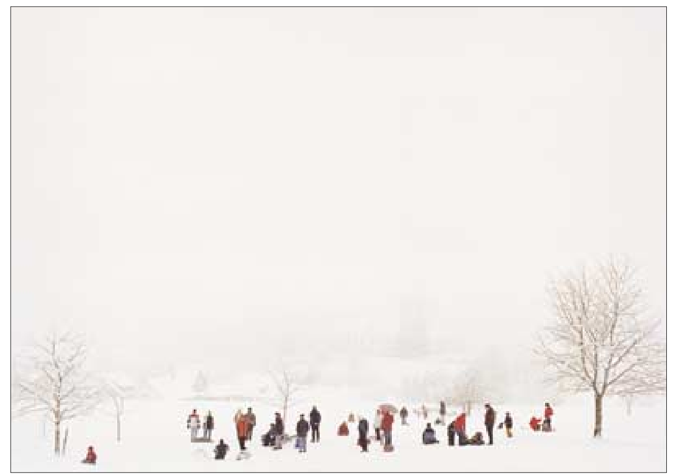
"Heimat, # 31", 2004