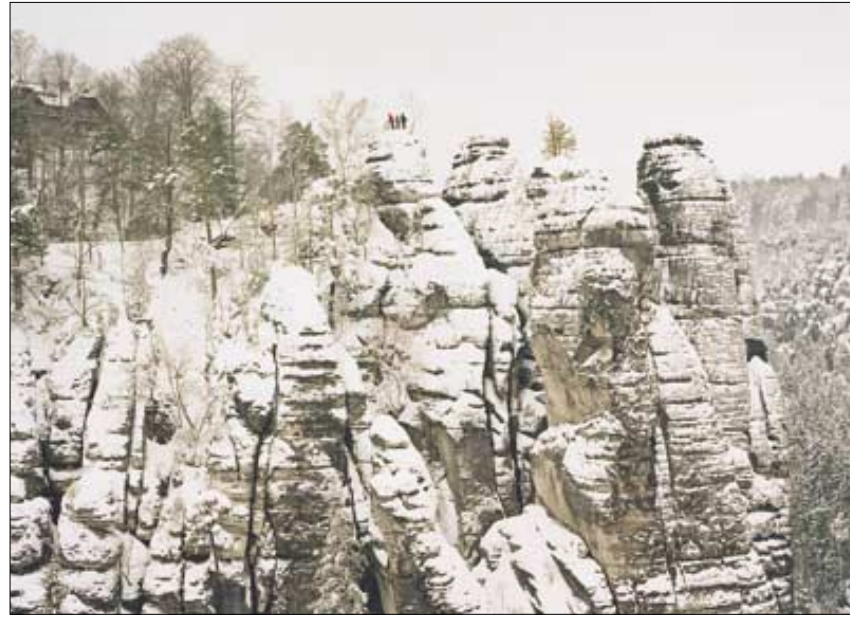
"Heimat, #13", 2005