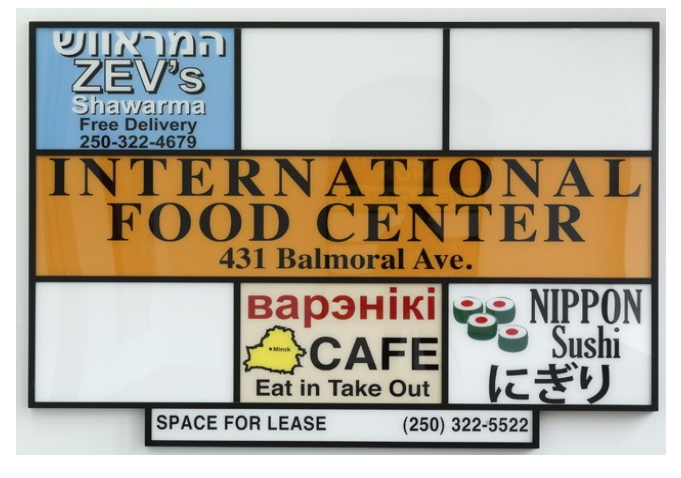
"International Food Center", 2009, Aluminium lacquer enamel, plexiglas letters, approx 170 x 231 cm

During 25 years of making art, Lum has been referred to as a sculptor, installation artist, photographer, painter, and performance artist. He refuses to be restricted to any one medium or approach: his politically oriented practice draws on Conceptual, Minimal, and Pop art, while he adopts the form best suited to the project at hand, whether that is performance, painting, sculpture, public sculpture, photo-based work, or posters and artist's books. (...) Whichever medium he chooses to explore at a given point, Lum often works in series, each series walking a fine line between art and non-art as the artist consistently questions the tensions arising in the relationship between artifice and the everyday. Lum describes himself, tongue-in-cheek, as an "old-fashioned type