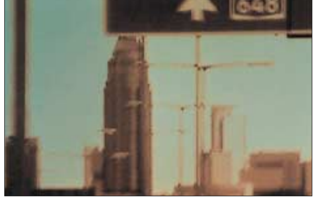
"Modern Sufferings Series" 2001, on Hand Made Paper, 40 x 50 cm

'Modern Sufferings Series" 2001, on Hand Made Paper, 40 x 50 cm