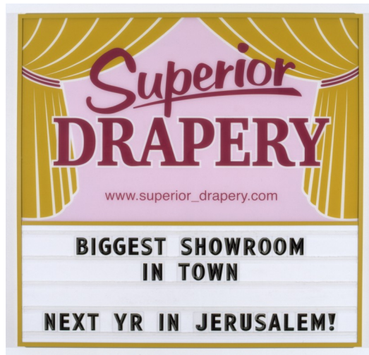
„Superior Drapery, 2002, Aluminium lacquer enamel, plexiglas letters, approx 198 x 198 cm

web of meanings given by others' words, meanings captured by inflections of the voice that refer to the context of the utterance, a context that includes the immediate circumstances but may also include far away times and places. The rich, echoing nature of language becomes especially apparent when we are talking to ourselves. Moments of reverie and self-reflection are the smallest of moments, the most fugitive, the most invisible to others, yet when we look into them we see that many presences crowd that small inner space. In many of Lum's pieces, the speaking or musing