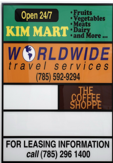
„Kim Mart“, 2009, Aluminium lacquer enamel, plexiglas letters approx. 178 x 198 cm