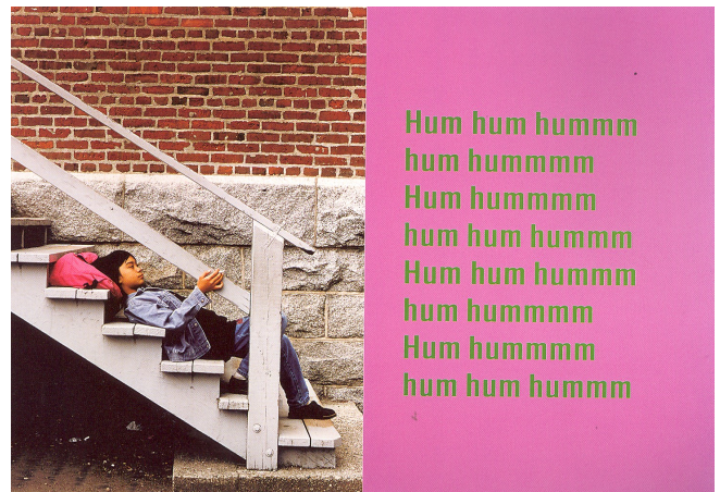
„Hum, Humm, Hummmm“, 1994, Laminated chromogenic print, lacquer aluminium, approx. 189 x 243 cm