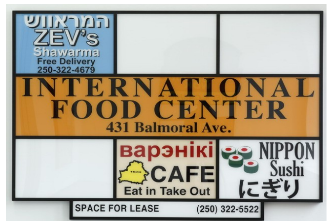
„International Food Center“, 2009, Aluminium lacquer enamel, plexiglas letters, approx. 170 x 231 cm

During 25 years of making art, Lum has been referred to as a sculptor, installation artist, photographer, painter, and performance artist. He refuses to be restricted to any one medium or approach: his politically oriented practice draws on Conceptual, Minimal, and Pop art, while he adopts the form best suited to the project at hand, whether that is performance, painting, sculpture, public sculpture, photo-based work, or posters and artist's books. (...) Whichever medium he chooses to explore at a given point, Lum often works in series, each series walking a fine line between art and non-art as the artist consistently questions the tensions arising in the relationship between artifice and the everyday. Lum describes himself, tongue-in-cheek, as an "old-fashioned type