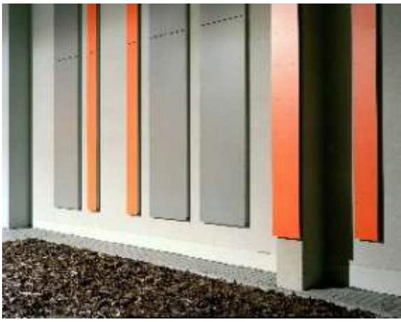
Wainscotting, Vertäfelung, 2010, C- Print on aluminium behind matt Plexiglas,

apply to these spaces at this moment, and neither does the question of what will happen to them once they are used up and exhausted. They can only be given up and replaced by others.