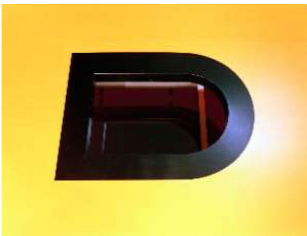
Big, 2010, C- Print on aluminium behind matt Plexiglas, approx.. 120 x 152 cm